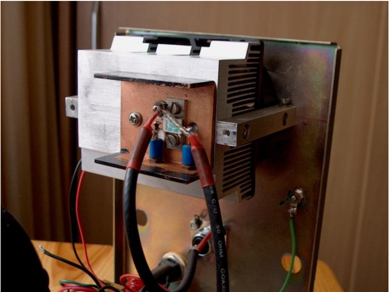
Pomiar mocy do 100W wykorzystano rezystor 50 om z tłumikiem 20db