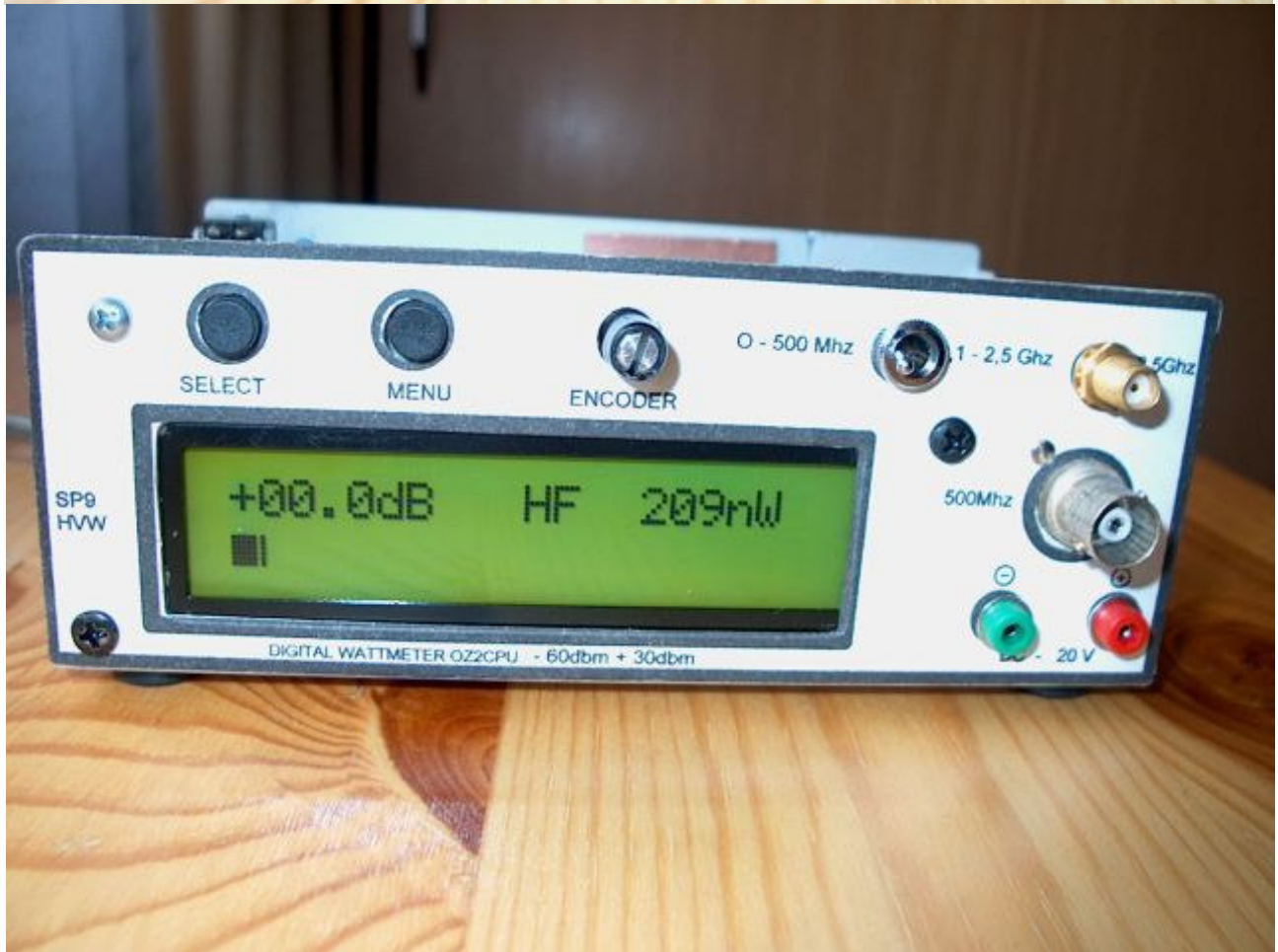
Miernik OZ 2- CPU